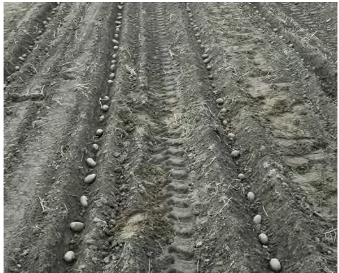
Seed potatoes can be planted in furrows (above) or mounds.