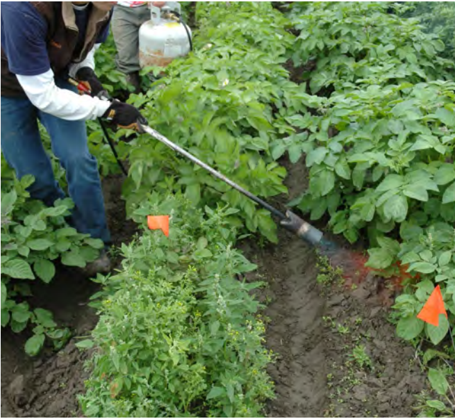
Flame weeding controls weeds within the potato row and on the sides of raised potato beds.

chopping action to remove the weed roots or pulling entire weeds by hand can damage the tubers.