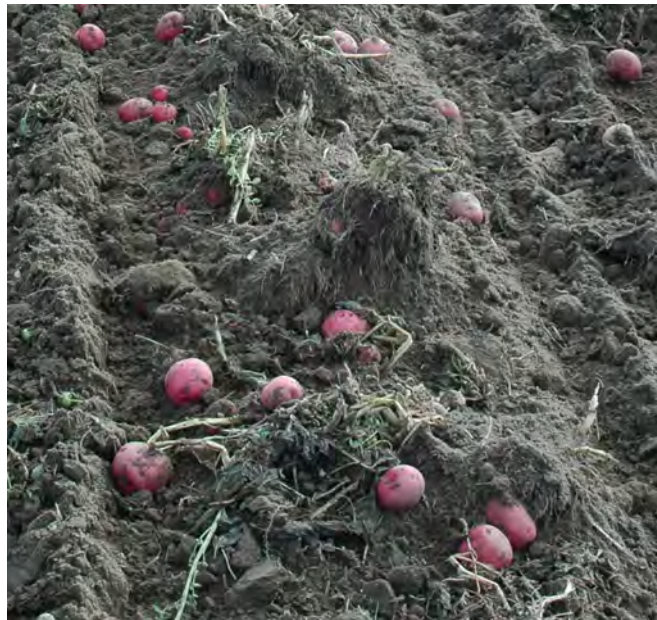
Cutting back the vines one to two weeks before harvest allows the potato skin to toughen before storage.

While the optimal storage condition for potatoes is a dark, cool, high humidity area, most homes are not equipped to meet the exact storage standards used by commercial producers. Simply storing your potatoes in a cool place where they are not exposed to light or at risk of freezing will suffice for a few months. If the potatoes freeze, they will fall apart once they are thawed and become inedible. A few