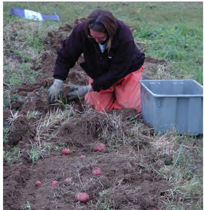
Potatoes can be harvested both during the growing season and at the end of the growing season.

Single drop seed pieces are small potatoes, 1 to 2 inches in diameter, which are planted whole. Some gardeners will pay a premium for single drop potatoes because they do not need to be cut be-